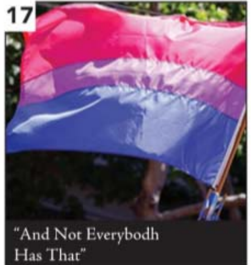
17 "And Not Everybodh Has That"